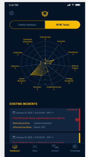
Cybereason MDR Mobile App