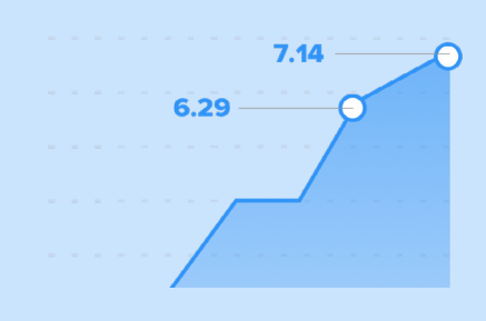
14% Boost in DEX Score... 6.29 to 7.14